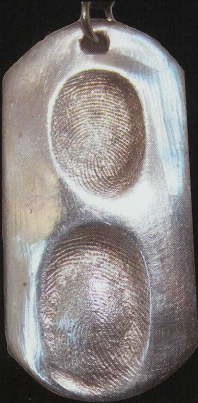
Silver Military Style Pendant with Two Fingerprints (customized with your loved ones fingerprints)